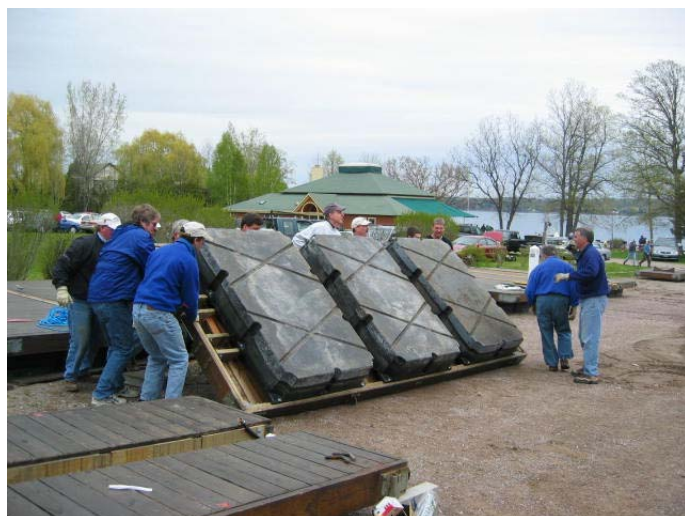
Dockwork in Progress—Spring Workday 2005