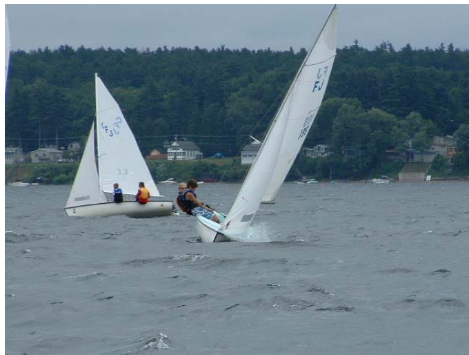
Trading Tacks at the Junior Sailing Regatta July 2005